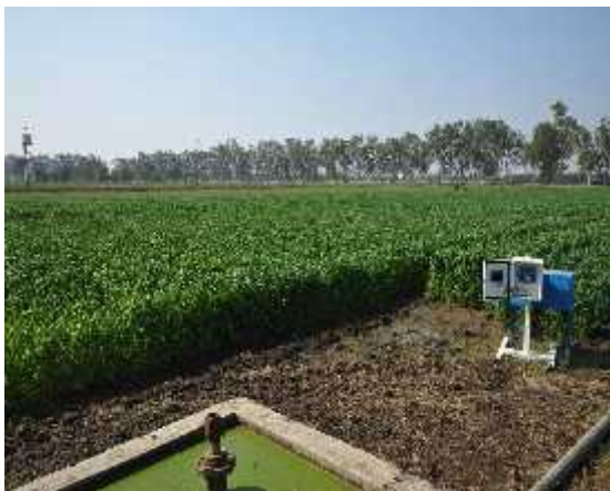
Figure 3: WSNs to improve wheat crop production in bed farming

Drip Irrigation Automation: A low-cost wireless controlled irrigation for real time monitoring of water content of soil has been monitored with the help of wireless sensors [10]. The data is recorded by using solar energy for the wireless station for the purpose of control of valves to do irrigation. Diagram showing the automated drip irrigation system is depicted in Figure: 2.