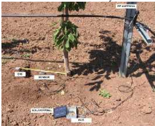
Figure 2: Application of WSNs in drip irrigation

Humidity control —to keep the humidity within a particular range, which is required for disease control, maintain transpiration rate, reduce hydro stress, stomata opening and regulate the photosynthesis process etc. the temperature set point can be changed by humidity controller by selecting maximum allowable changes for a particular crop species based on the inside relative humidity value [62].